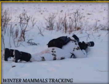
WINTER MAMMALS TRACKING