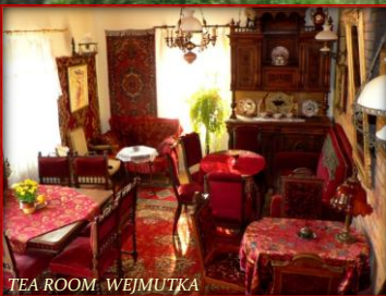
TEA ROOM WEJMUTKA