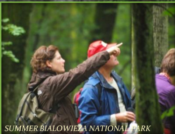
SUMMER BIALOWIEZA NATIONAL PARK