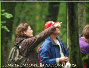
SUMMER BIALOWIEZA NATIONAL PARK